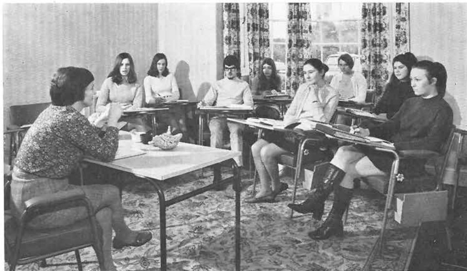
Classroom teaching in a lecture room at the School of Nursing.