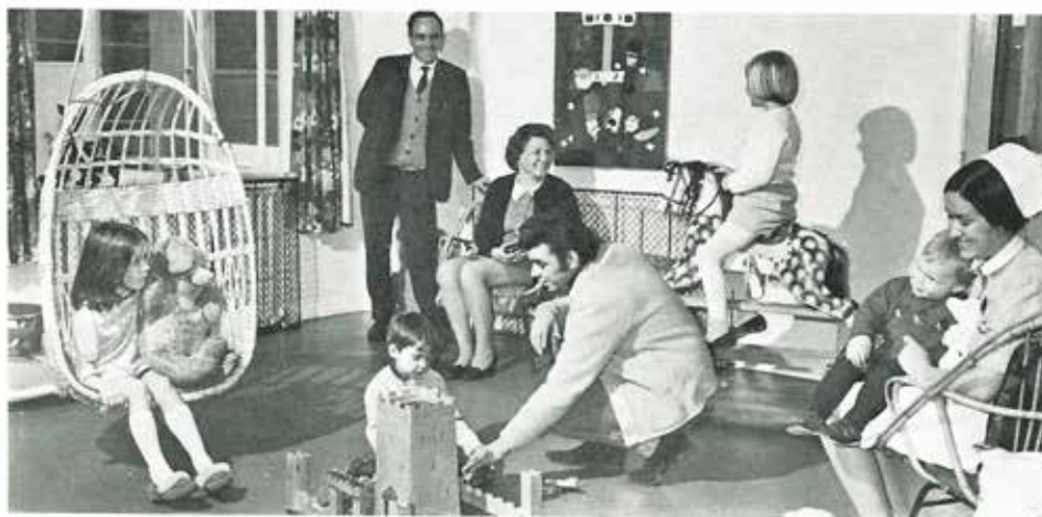
(Above) A State Enrolled nurse at the bedside of a patient in a ward at the Newbridge branch. (Left) A happy picture of children playing in the day room attached to a children's ward at the Odstock branch.