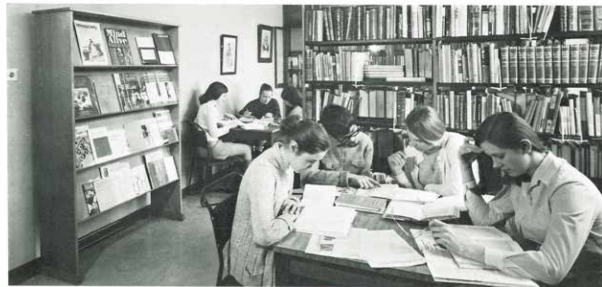
The Salisbury School of Nursing has an extensive library with excellent study facilities.

Training in nursing is a blend of classroom teaching and clinical work, students being allocated to the wards and departments to meet the needs of their particular training programme. Visits are made to the day school for handicapped children, the rehabilitation workshops and the model kitchen for re-education of disabled patients, and outside the Hospital with the district nurse and health visitor to study health care in the community.