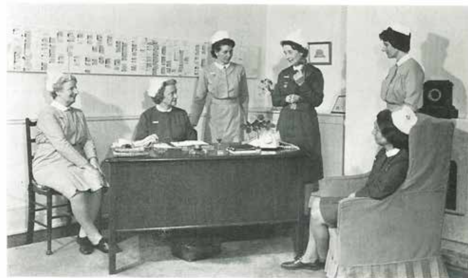
Senior nursing staff in discussion.

There is a wide choice in the place where you can work as a nurse—not only in a hospital but in the patient's own home, in a school, a factory, in the armed forces—and abroad, too. The choice is yours. Make it now. Train to be a good nurse at Salisbury General Hospital.