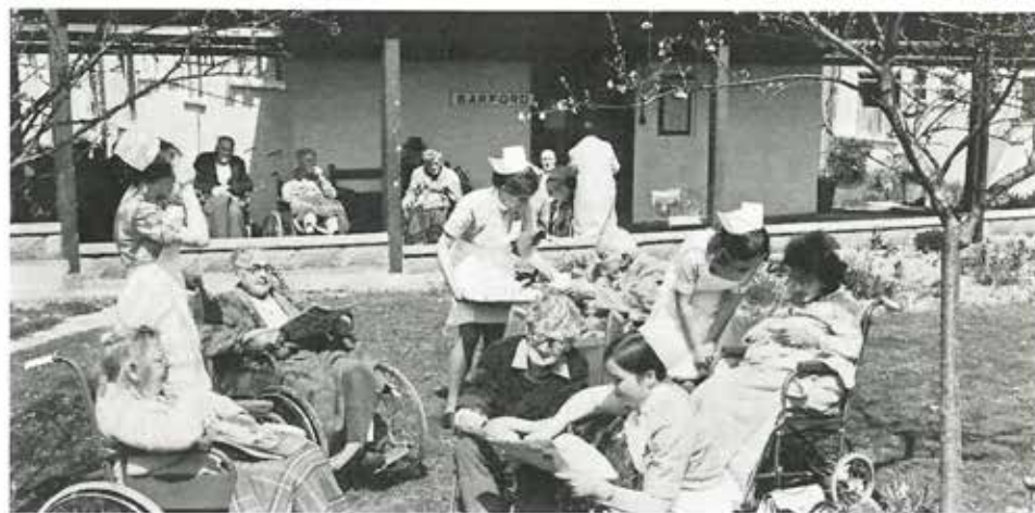
(Above) In the treatment room at the Odstock branch. There are the most modern facilities for nursing and treatment at Odstock. (Right) An out-of-doors scene at the Newbridge branch which specialises in geriatric cases.

Today, Salisbury General Hospital is three hos-