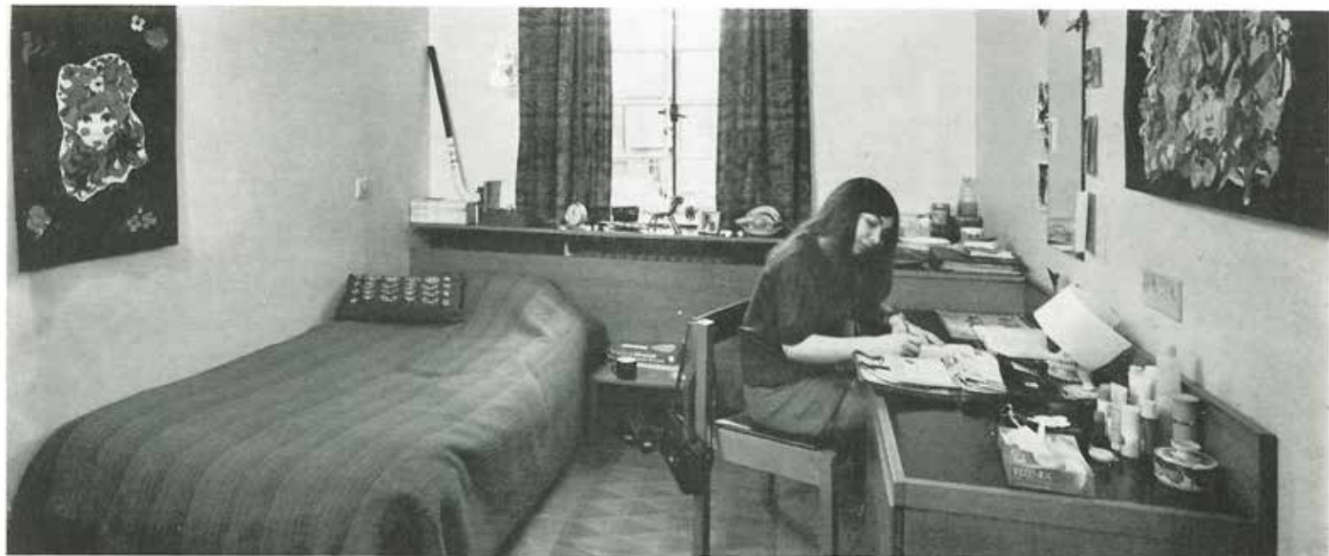
A nurse's room at one of the modern and comfortable residences. Nurses are only required to live in during their first year of training.