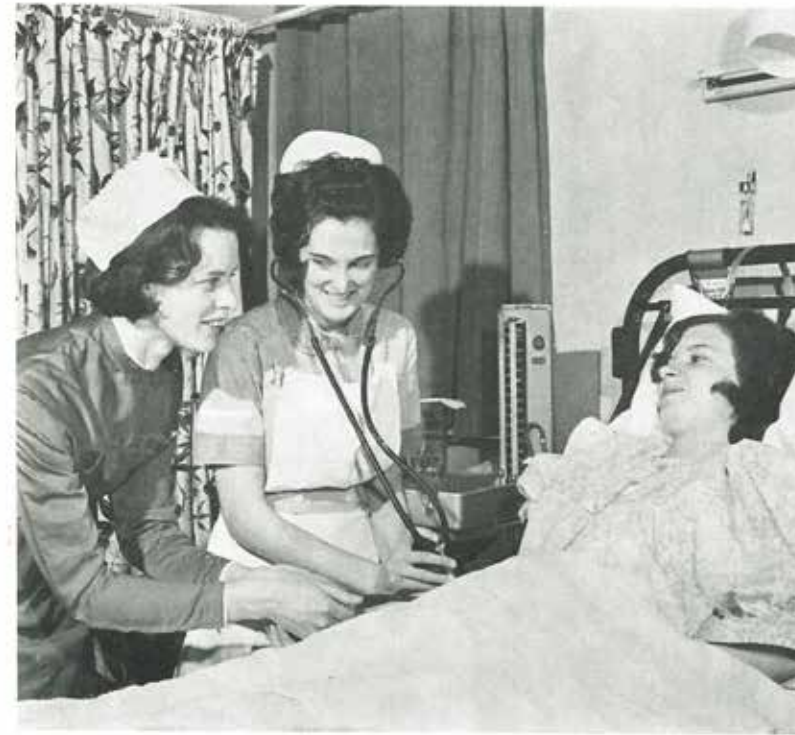
A clinical teacher giving instruction on the ward.

Following the general introduction of educational qualifications for nurses in training just before the last war, the need for improved preparation of nurses before working on the wards led, in 1947, to the establishment of a preliminary training school. In 1950, a post graduate course of nurse training in plastic surgery was introduced and another landmark was reached three years later with the setting up of a pre-