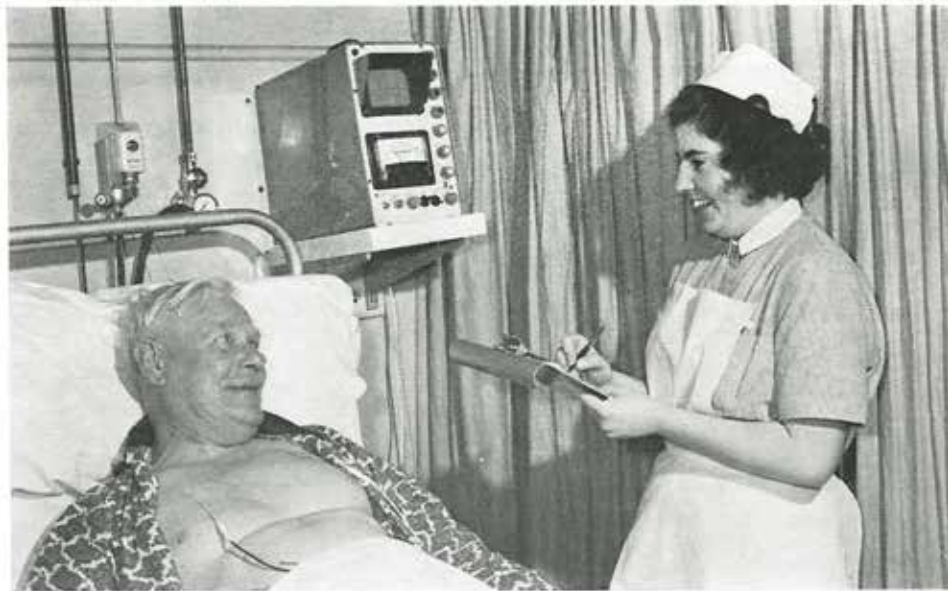
(Above, left) An enrolled nurse and a pupil nurse working in an orthopaedic ward. (Above, right) In the treatment room attached to the ear, nose and throat ward at Odstock. (Right) Checking the reading of a cardiac monitor at the Infirmary branch.